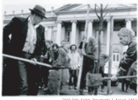
7000 Oaks Action, Documenta 7, Kassel. 1982

That project, however, remains unfinished owing to the death of Beuvs on 23 January 1986.