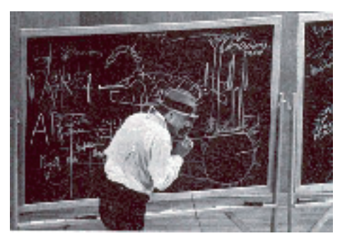
Social Sculpture, New York, 1974