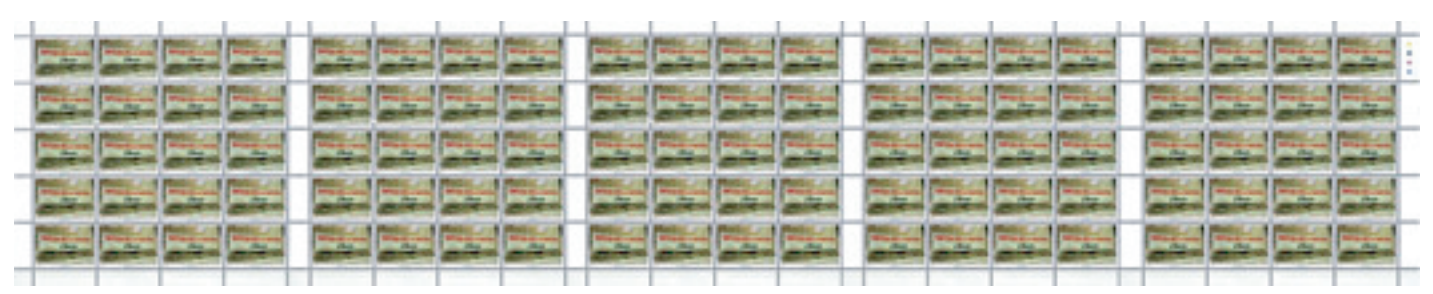
The Defense of Nature, Sheet of Postage Stamps of the Republic of San Marino, 200

Beuys had also put a lot of German romantic thought into that "virtual suitcase": Hegel, Novalis, Shelling...bearing Goethe particularly in mind, mediated also by the anthroposophic philosophy of Rudolf Steiner<sup>5</sup>.